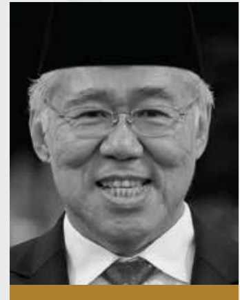
Enggartiasto Lukita Minister of Trade of the Republic of Indonesia Menteri Perdagangan Republik Indonesia