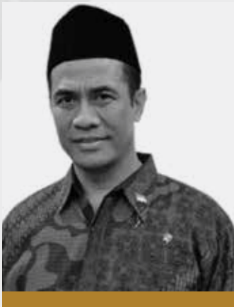
Andi Amran Sulaiman Minister of Agriculture of the Republic of Indonesia Menteri Pertanian Republik Indonesia