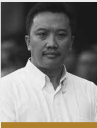
Imam Nahrawi Minister of Youth & Sports Affairs Menteri Pemuda dan Olahraga Republik Indonesia